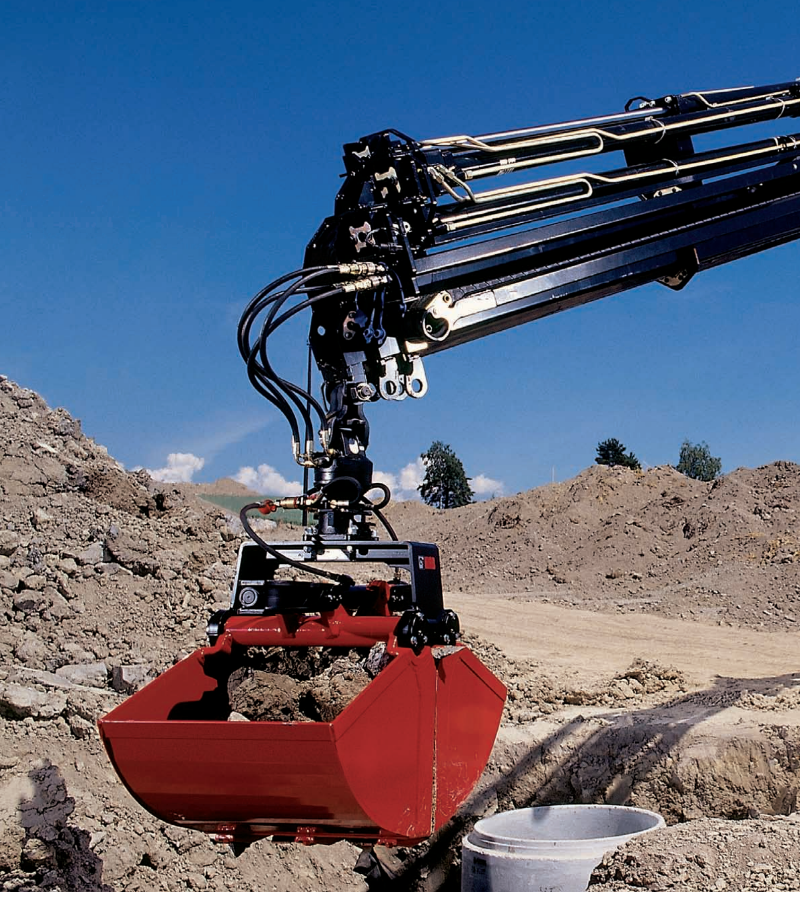
The tough and lightweight solution