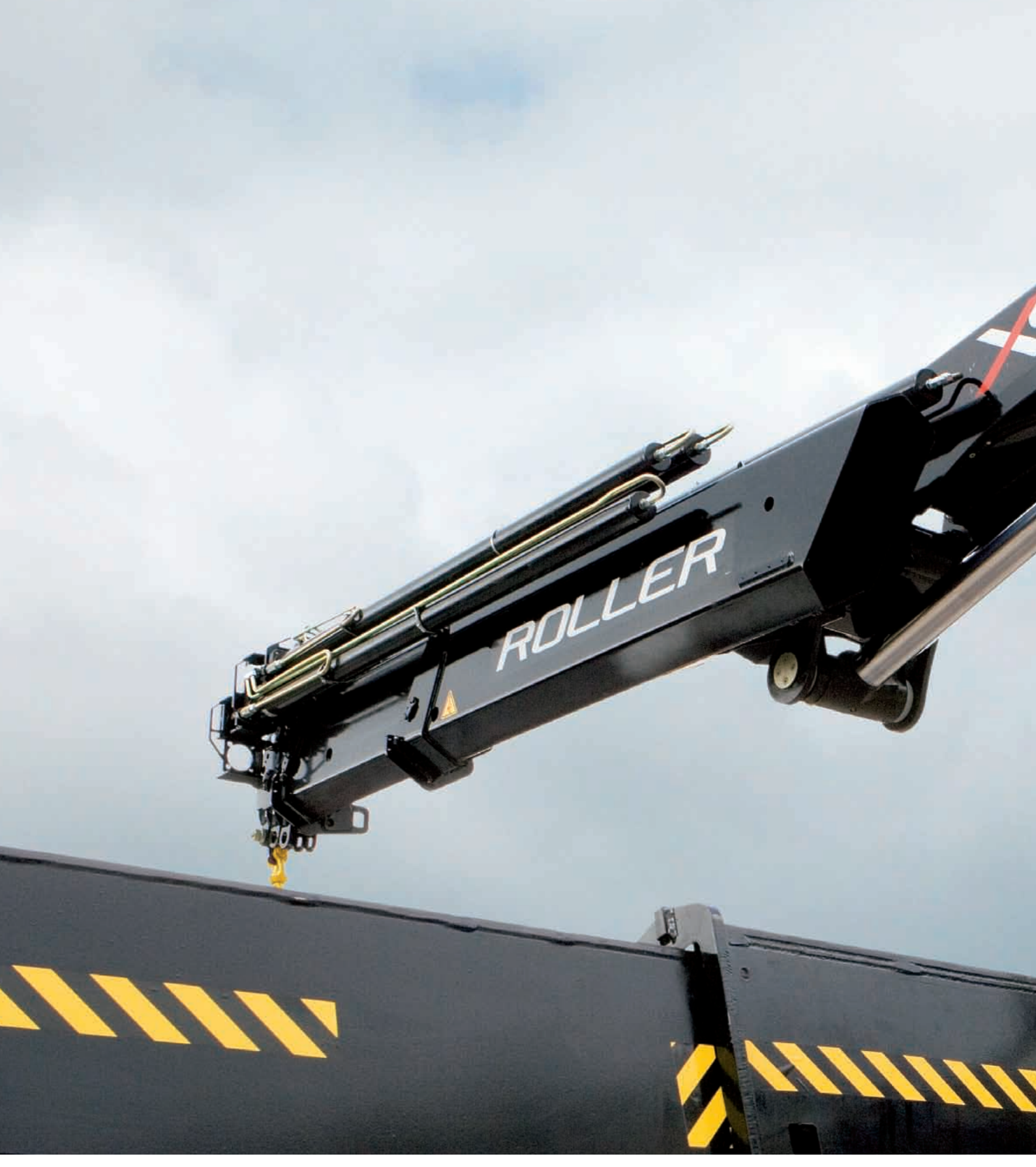
Greater load handling area